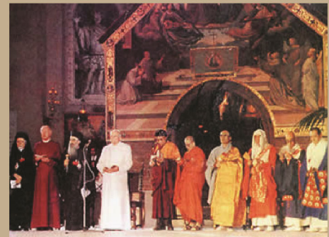
Pope John Paul II hosts ecumenical gathering, Assisi, Italy, October 1986.

While John XXIII made the papacy more accessible to the people of Rome, John Paul II made it accessible to the world. During his 27-year papacy, he visited 129 countries becoming one of the most traveled world leaders. He used the global stage to promote peace and justice for all. He attended every session of Vatican II and served on the drafting committee of the Pastoral Constitution on the Church in the Modern World ( Gaudium et Spes ).