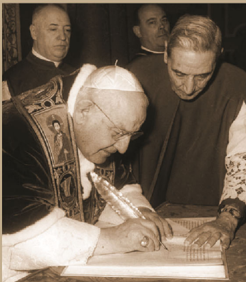
Pope John XXIII signs document convoking the Second Vatican Council December 25, 1961.

Today’s canonization coincides with the 50th anniversary of Vatican II. Little in the priesthood of Angelo Giuseppe Roncalli would suggest that one day he would be pope—let alone guide an ecumenical council that would revitalize the Church in response to the needs of the modern world.