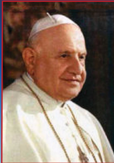
JOHN XXIII 1881-1963

BLESSED POPES JOHN XXIII AND JOHN PAUL II CANONIZED TODAY