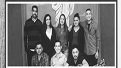
CORO NUEVA GENERACION

PARROQUIA SAN JOSE OBRERO (SALON PARROQUIAL)