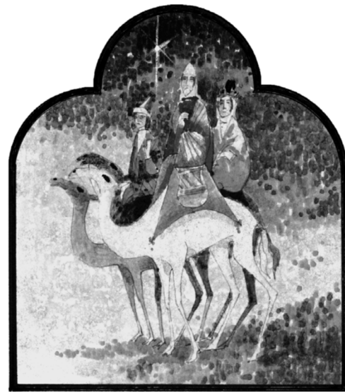
Magi from the east arrived