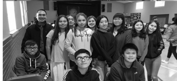
Youth volunteers serving at the Thanksgiving Baskets Project and the Red Cross Blood Drive