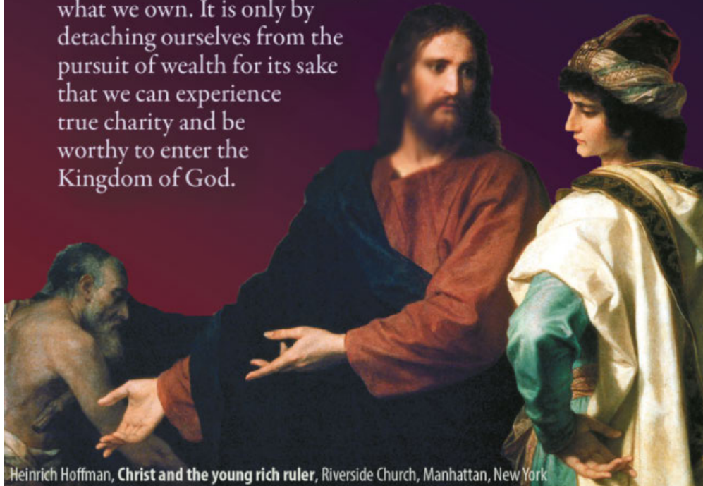
Heinrich Hoffman, Christ and the young rich ruler , Riverside Church, Manhattan, New York

We should not be possessed by what we own. It is only by detaching ourselves from the pursuit of wealth for its sake that we can experience true charity and be worthy to enter the Kingdom of God.