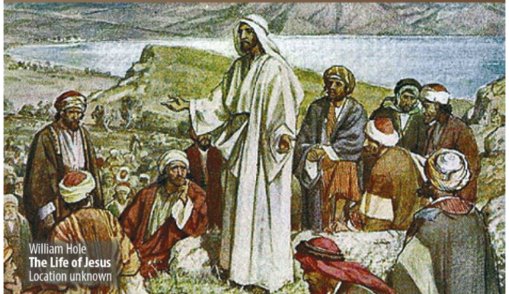
William Hole The Life of Jesus Location unknown

St. Joseph the Worker Catholic Church • 19855 Sherman Way • Winnetka, California