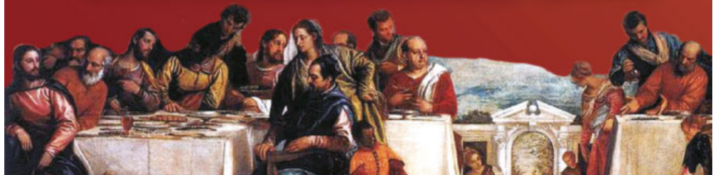
Paolo Veronese, Feast at the House of Simon , Pinacoteca di Brera, Milan,

Jesus loved the gatherings around meals. In this Sunday reading, he is among the Pharisees who always try to trick him into saying something they can criticize. There is no tricky question here, but Jesus notices how the guests, while gathering, were choosing the places of honor. That gives him the opportunity to tell a parable about meal seating and the importance of humility. The proud guests who seat at the table closest to the host risk the public humiliation of being asked to give up their place, but the humble guests who go to a more distant table may be asked to move to a better seat. In the words of Jesus, as recorded by the Evangelist, "Everyone who exalts himself will be humbled, but the one who humbles himself will be exalted." (Lk 14:11)