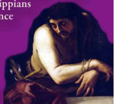
Juan Fernández Navarrete, St John the Baptist in Prison Hermitage Museum, Saint Petersburg, Russia

The third candle is also called the "Shepherd's Candle" in remembrance of the joy the shepherds experienced when angels appeared to them announcing the good news of Jesus' birth. We are encouraged today to "Rejoice in the Lord always" (Philippians 4:4-5) and experience that same joy.