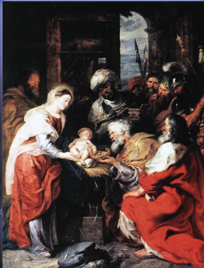
The Adoration of the Magi (1626-1629)

Peter Paul Rubens, Oil on canvas, Musée du Louvre, Paris