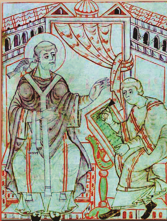
Pope Gregory I dictating the Gregorian chants.

The memorial of St. Gregory the Great (540–604), September 3, commemorates the life of a mayor of Rome, monk, pope, and Doctor of the Church. Pope St. Gregory implemented reforms to improve church governance, promoted the monastic vocation, and renewed the liturgy. His name is associated with Gregorian chant (plainsong). Although the church gave him the honorific title "Magnus" — the Great, Gregory himself preferred to be known as "servant of the servants of God."