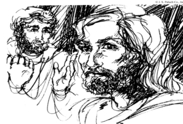
Jesus rebuked Peter: “Get behind me, Satan!”

Call the school for an appointment between 9:00 a.m. and 2:00 p.m. for registration information and to observe the class that you are interested in for an appointment. You can also find registration forms on-line.