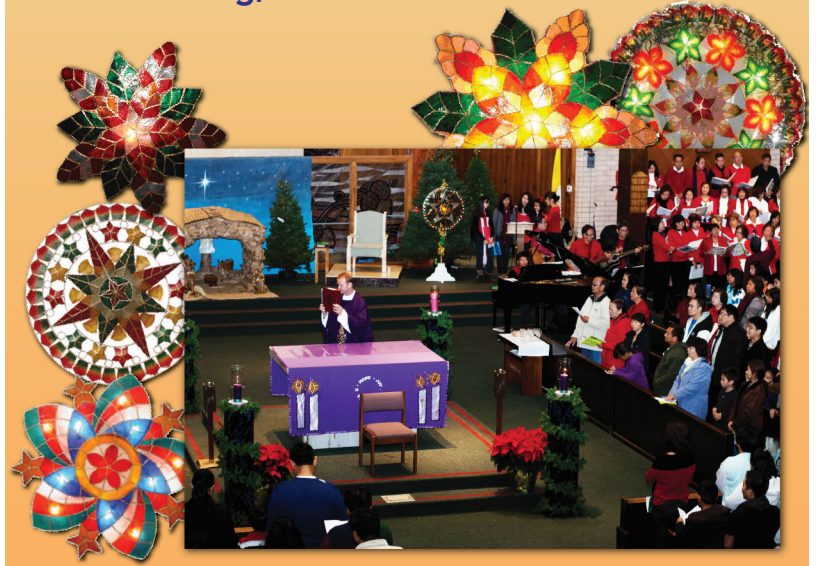
Simbang Gabi, or "Night Mass," is celebrated in parishes throughout the archdiocese. All are invited to this beautiful liturgy in preparation for the coming of our Lord Jesus Christ.