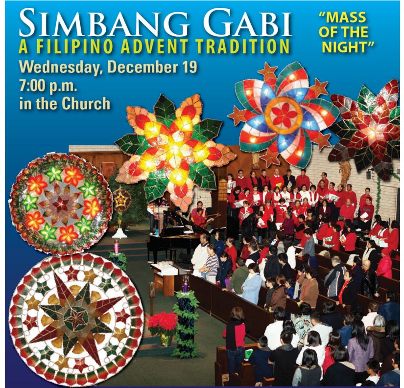
Simbang Gabi, or "Night Mass," is celebrated in parishes throughout the archdiocese. All are invited to this beautiful liturgy in preparation for the coming of our Lord Jesus Christ.