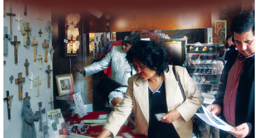
4th Sunday of Easter • May 12, 2019

At the Sherman Way entrance to the church Sundays: 7:00 a.m. - 1:00 p.m.