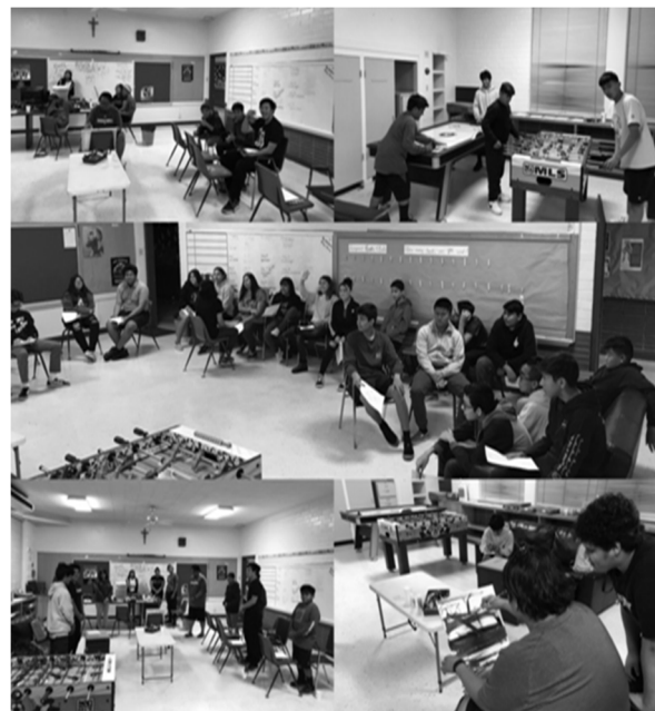
New Youth Ministry Room Inside the School

Sunday, December 1 , 8:30 a.m. to 3:30 p.m. (Hall): American Red Cross Blood Drive Service Project