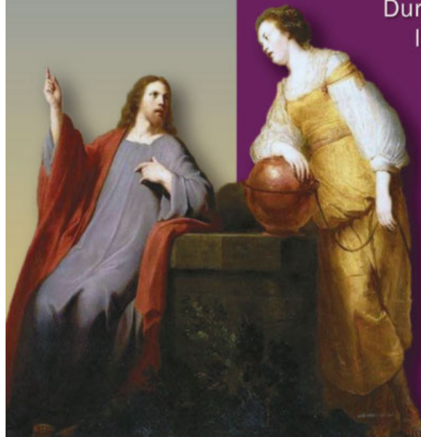
Pieter de Grebber Christ and the Woman of Samaria Private Collection

During this season of Lent let's renew our belief in Christ's promise of salvation and the spiritual water the only he can give.