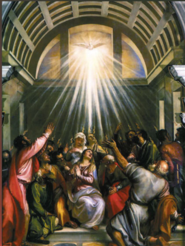
Titian Pentecost Santa Maria della Salute Venice, Italy

St. Joseph the Worker Catholic Church • 19855 Sherman Way • Winnetka, California Phone (818) 341-6634 • Fax (818) 341-3875 • www.sjwchurch.com • Email parish@sjwchurch.com