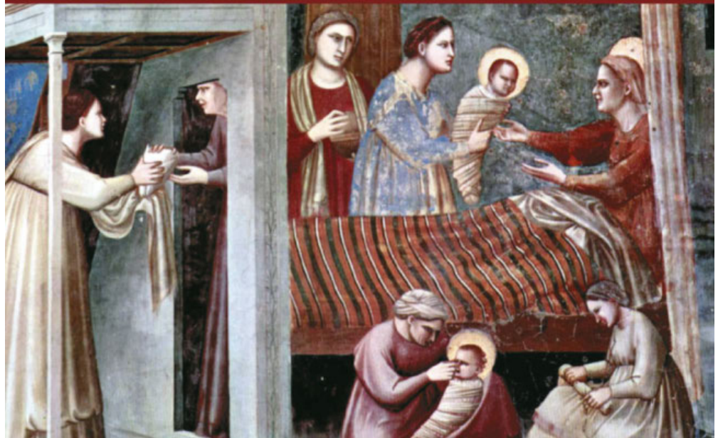
Giotto • Scenes from the Life of Mary: The Nativity of the Theotokos • Scrovegni Chapel • Padua, Italy

Mary is the Theotokos . The word Theotokos derives from two Greek terms— Theos (God) and tiktein (to give birth)—and means the one who gave birth to God. The title has been given to Mary to reflect the teaching of the Church that Jesus was both Divine and human. In English, the title commonly used is simply Mother of God.