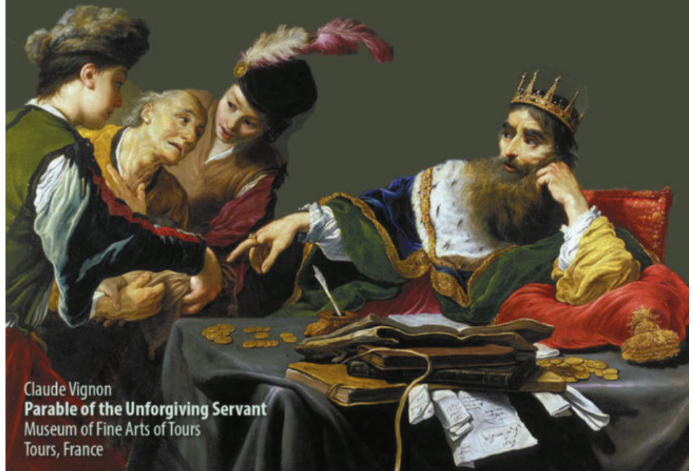
Claude Vignon Parable of the Unforgiving Servant Museum of Fine Arts of Tours Tours, France

It is a vivid reminder of the highest command of the reciprocal charity Jesus gave his disciples and us. Out of love, as the heavenly Father does, we are to forgive from the heart the trespasses of others against us.