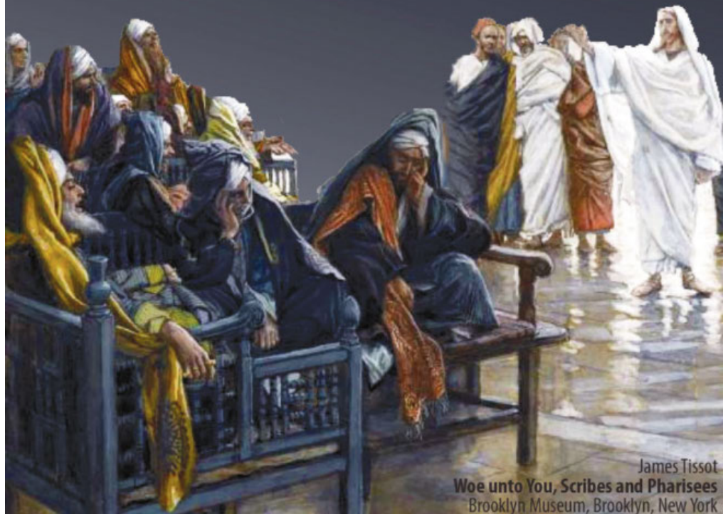
James Tissot Woe unto You, Scribes and Pharisees Brooklyn Museum, Brooklyn, New York

St. Joseph the Worker Catholic Church • 19855 Sherman Way • Winnetka, California Phone (818) 341-6634 • Fax (818) 341-3875 • www.sjwchurch.com • Email parish@sjwchurch.com