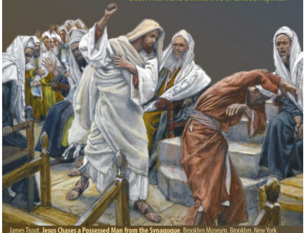
James Tissot, Jesus Chases a Possessed Man from the Synagogue , Brooklyn Museum, Brooklyn, New York

Are we listening? Let's always listen to the word of God with a clean heart and a mind free of unclean spirits.