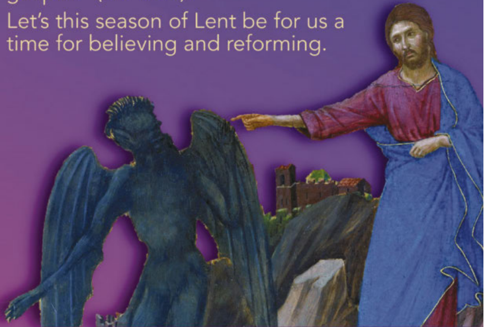
Duccio di Buoninsegna, Temptation on the Mount , The Frick Collection, New York, New York

Let's this season of Lent be for us a time for believing and reforming.