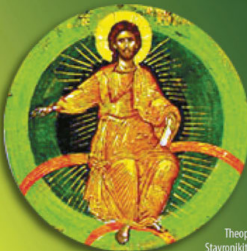
Theophanes the Cretan, The Ascension Stavronikita Monastery, Mount Athos, Greece

We too are followers of Christ and his prayer is for us too. We do not belong to this world, and Jesus is not praying for us to be taken out of it, but to be guarded from the evil one as long as we are in it.