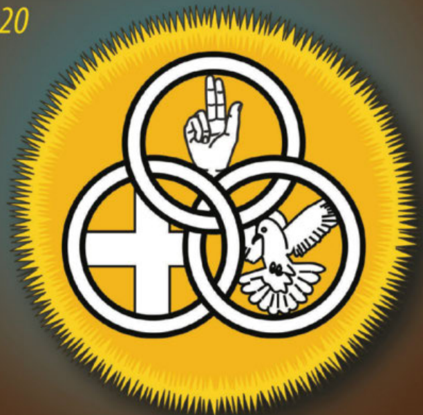
Badge of The Society of Our Lady of the Holy Trinity

St. Joseph the Worker Catholic Church • 19855 Sherman Way • Winnetka, California Phone (818) 341-6634 • Fax (818) 341-3875 • www.sjwchurch.com • Email parish@sjwchurch.com