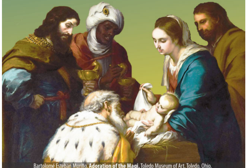
Bartolomé Esteban Murillo, Adoration of the Magi , Toledo Museum of Art, Toledo, Ohio.

Centuries ago, the world experienced its greatest revealing moment, its greatest Epiphany, when, as we hear in this Sunday's Gospel, the magi from the east followed the star of Bethlehem to the place where the newborn child was. Overjoyed, they prostrated themselves and did him homage. In the newborn Jesus they recognized God's revelation in human semblance and thus revealed the Son of Man to the world.