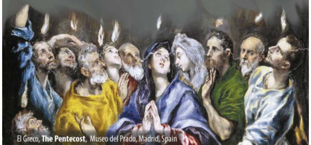
El Greco, The Pentecost , Museo del Prado, Madrid, Spain

It is Jesus himself who states how the Holy Spirit, the Counselor sent by the Father, completes his mission on hearth.