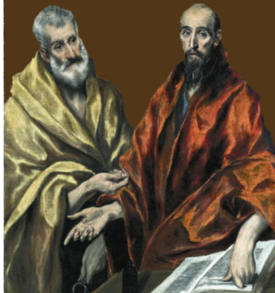
El Greco St Peter and St Paul Nationalmuseum Stockholm, Sweden

St. Paul, although not part of the Twelve, was instrumental in spreading the teachings of Jesus in the first-century and founding several Christian communities in Asia Minor and Europe.