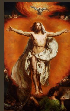
Jan Matejko, Ascension, National Museum, Warsaw, Poland

Jesus died, resurrected, and ascended to Heaven where he seats by God the Father. His work on this Earth is done. He was given full authority to eternal life, and now he passes it on to his Apostles in what is commonly known as the Great Commission, and prays for them.