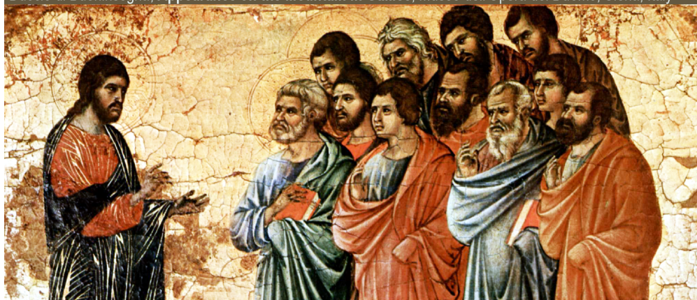
Duccio di Buoninsegna, Appearance on the Mountain in Galilee, Museo dell'Opera del Duomo, Siena, Italy

St. Joseph the Worker Catholic Church • 19855 Sherman Way • Winnetka, California