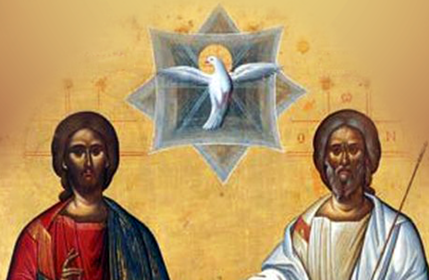
Possibly Elias Moskos or Michael Damaskinos, Benaki Museum, Athens, Grece

“God so loved the world that he gave his only Son” (Jn 3:16) and sent him into the world so that we believe. Jesus completed his work on earth and is now reunited with the Father, but left us the Holy Spirit who is always with us.