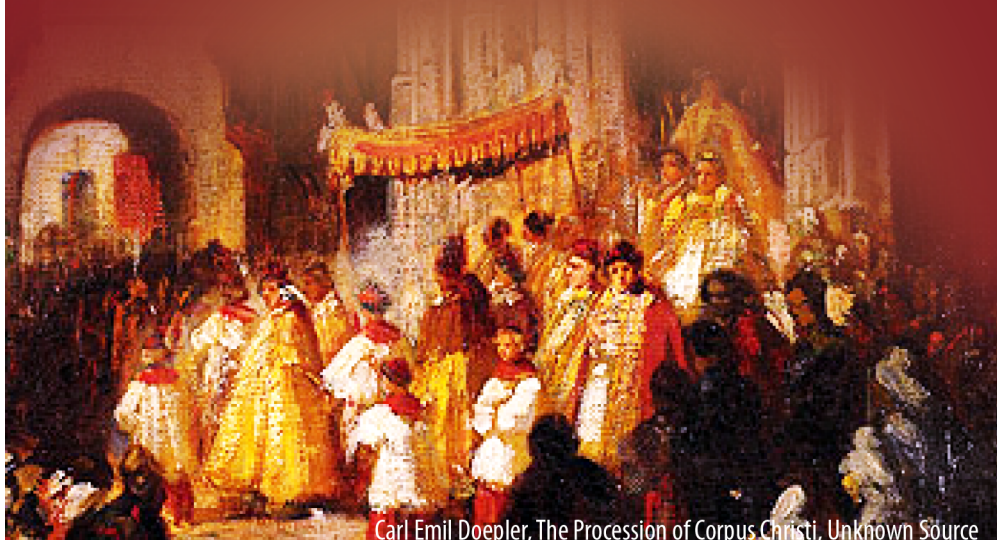
Carl Emil Doepler, The Procession of Corpus Christi

The Feast of Corpus Christi also known as the Solemnity of the Most Holy Body and Blood of Christ , is a liturgical solemnity celebrating the real presence of Christ in the Eucharist. Often, the feast is celebrated with a procession that takes the body of Christ in a monstrance outside the tabernacle and the church. The procession tradition was very prominent in the past, but is less common today. Nowadays, in many churches the Body of Christ can be adored in a monstrance every week on a dedicated day of the week.