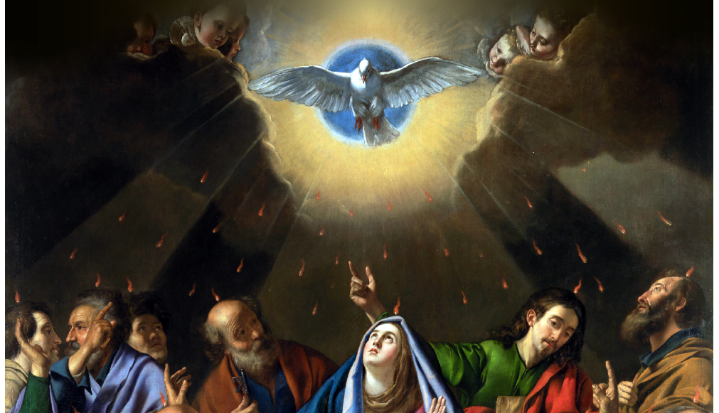
Juan Bautista Maíno, Pentecostés , Museo del Prado, Madrid, Spain

Although we do not see a dove above us and we don't have flames descending on us, Jesus assures us that the Holy Spirit is always with us as it was with the disciples on that day of Pentecost that established the church and its mission.